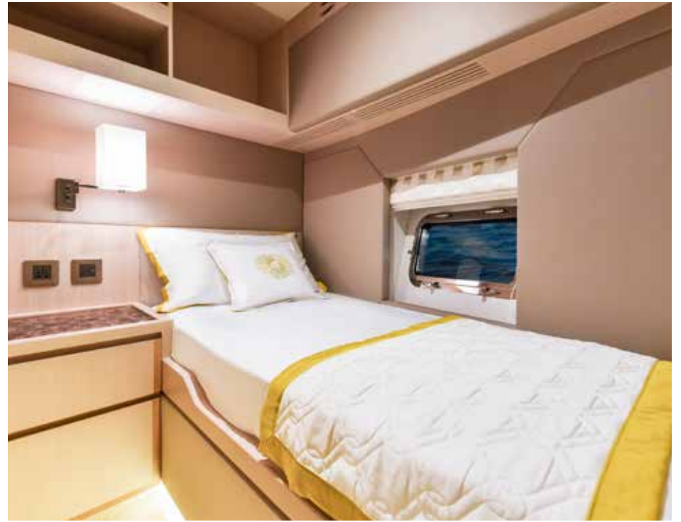
Forward VIP Guest Head | Guest Cabin