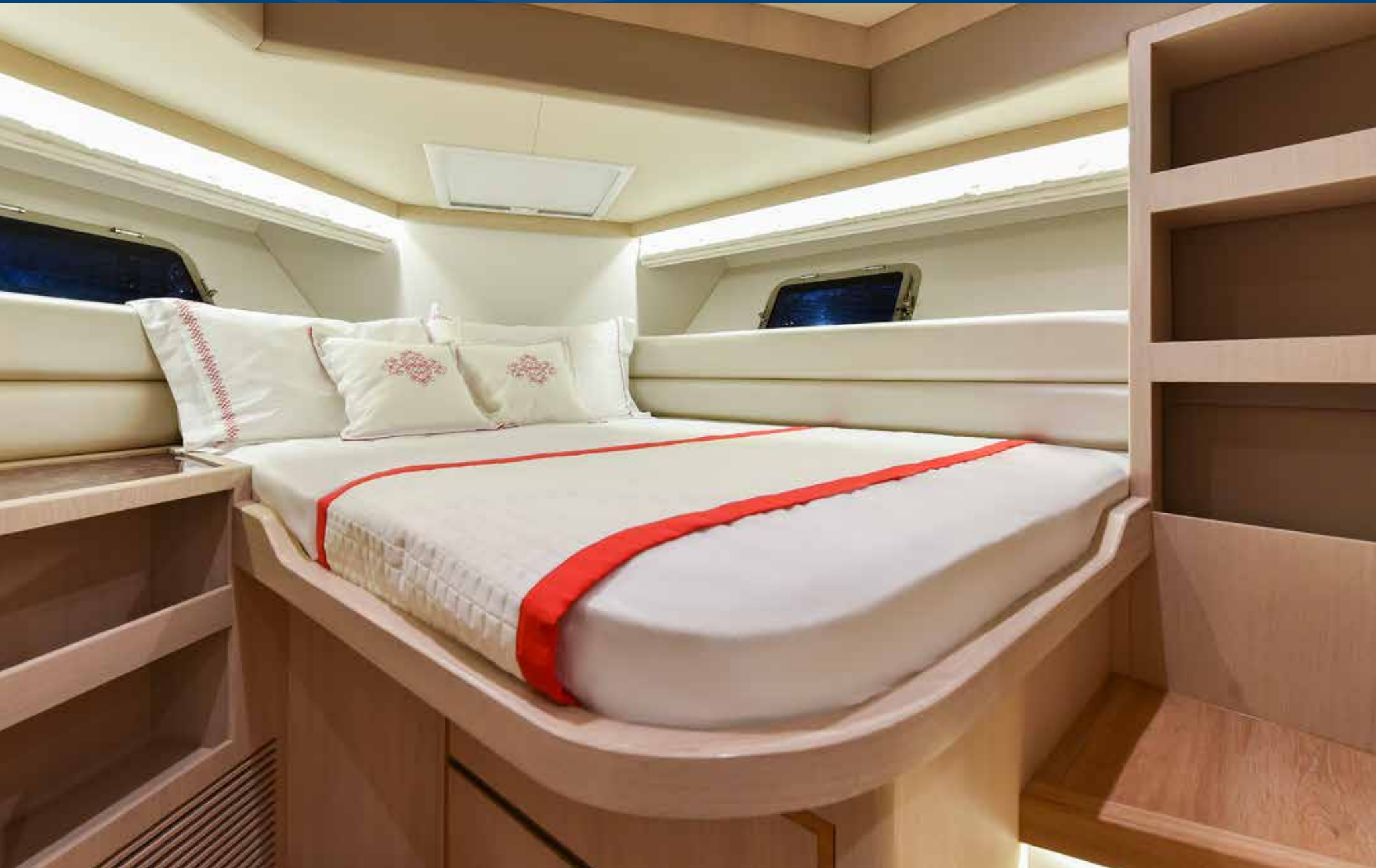
Forward VIP Guest Cabin