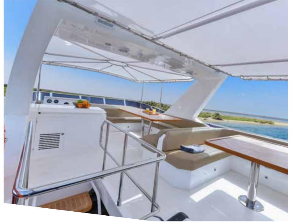
Bow Seating | Fly-bridge