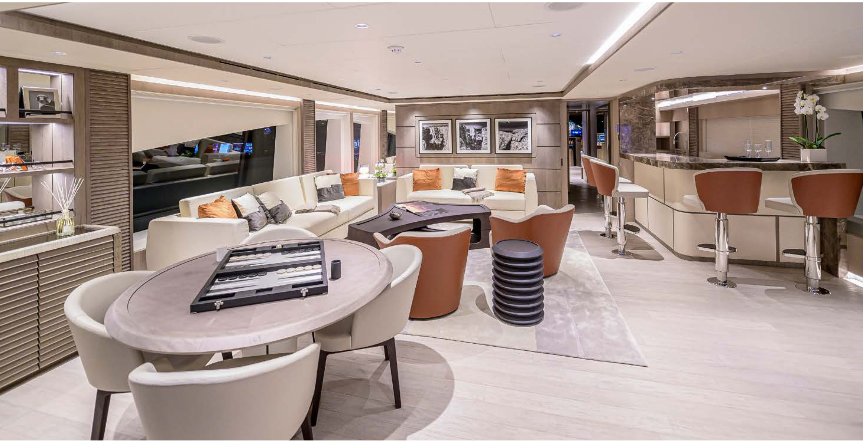
Upper Deck Saloon