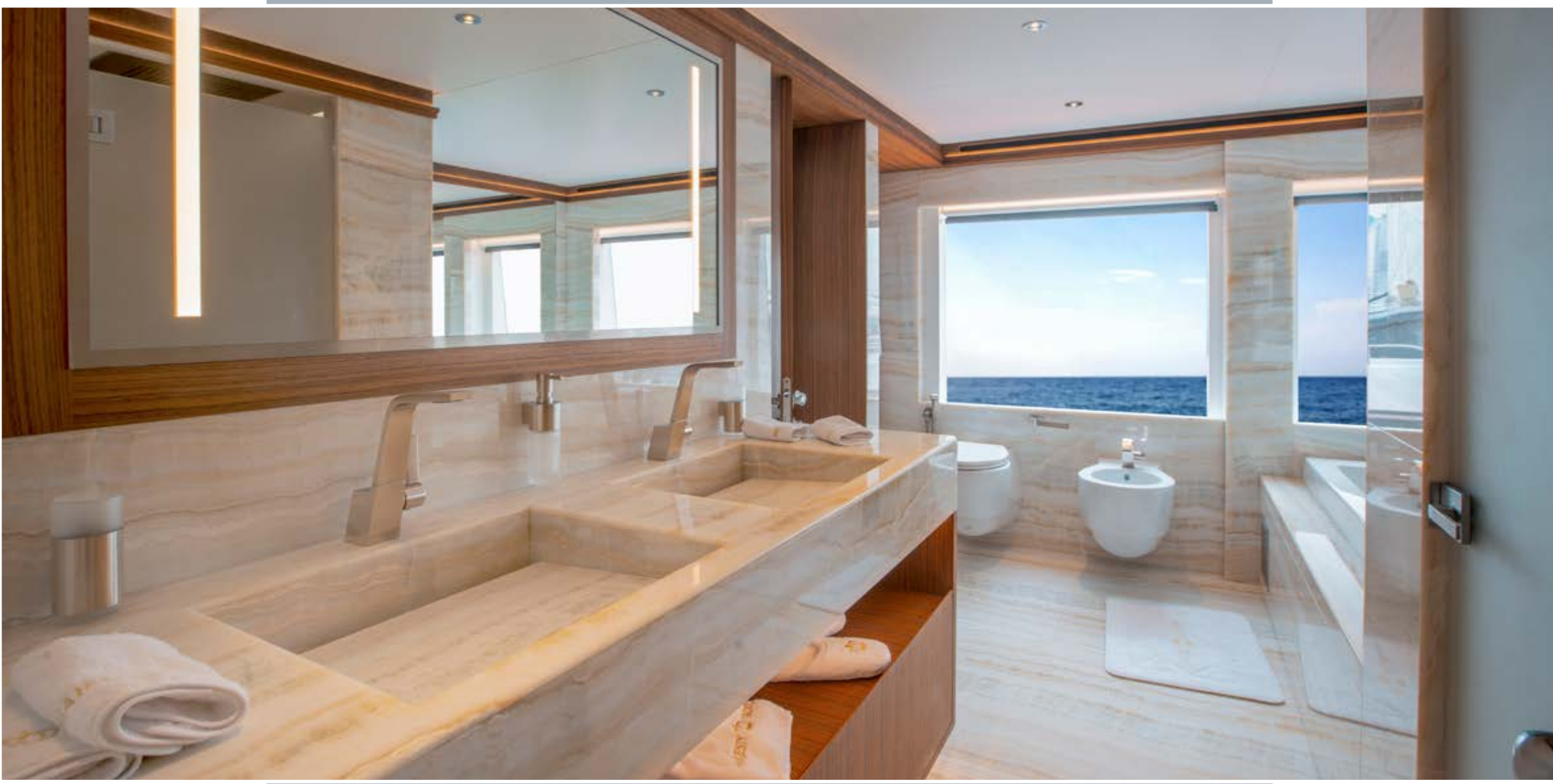
Owner's En Suite