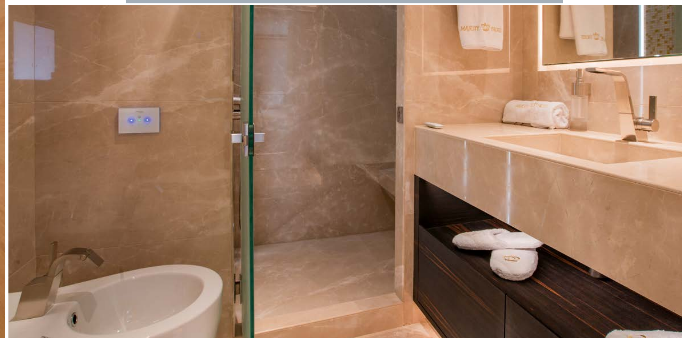
Twin Guest En Suite