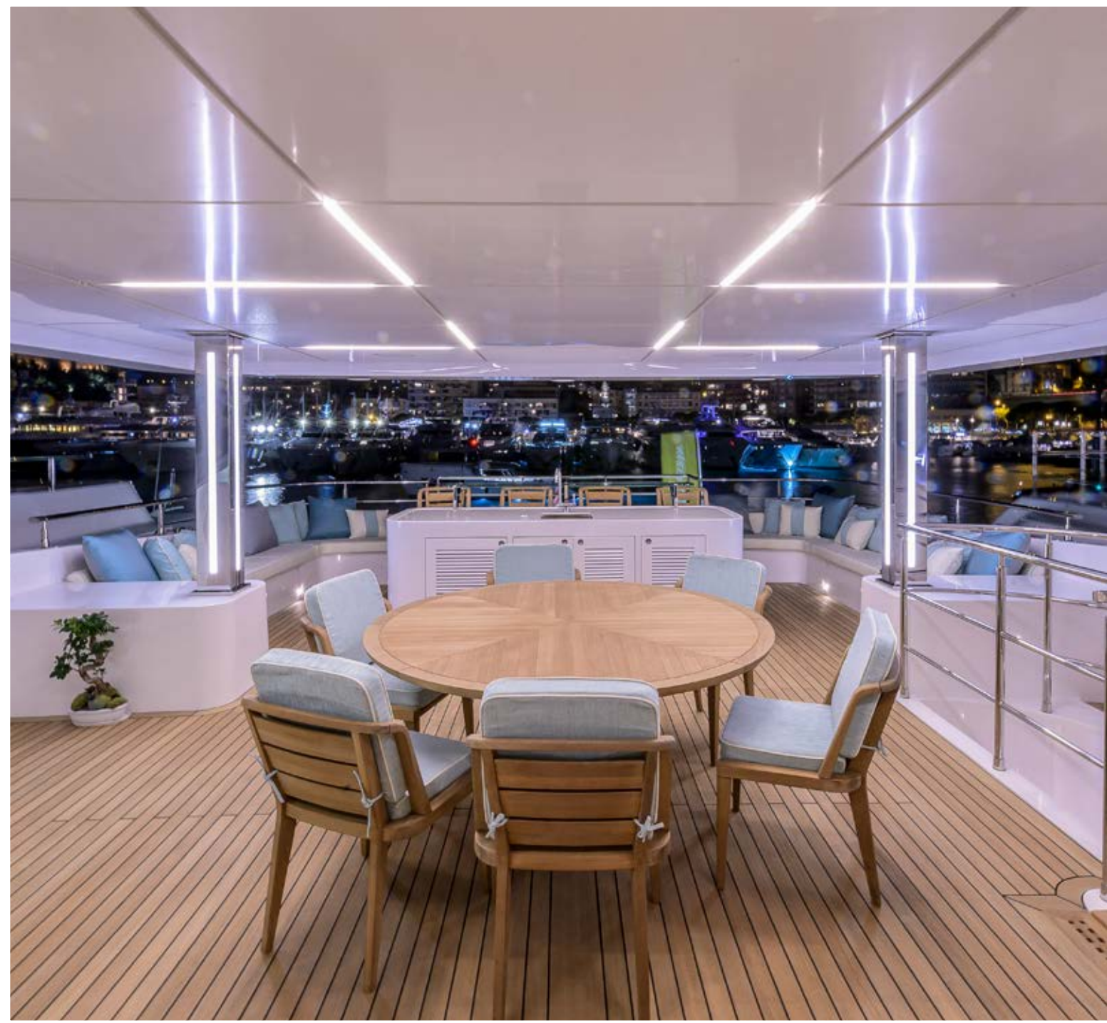
Upper Deck Aft