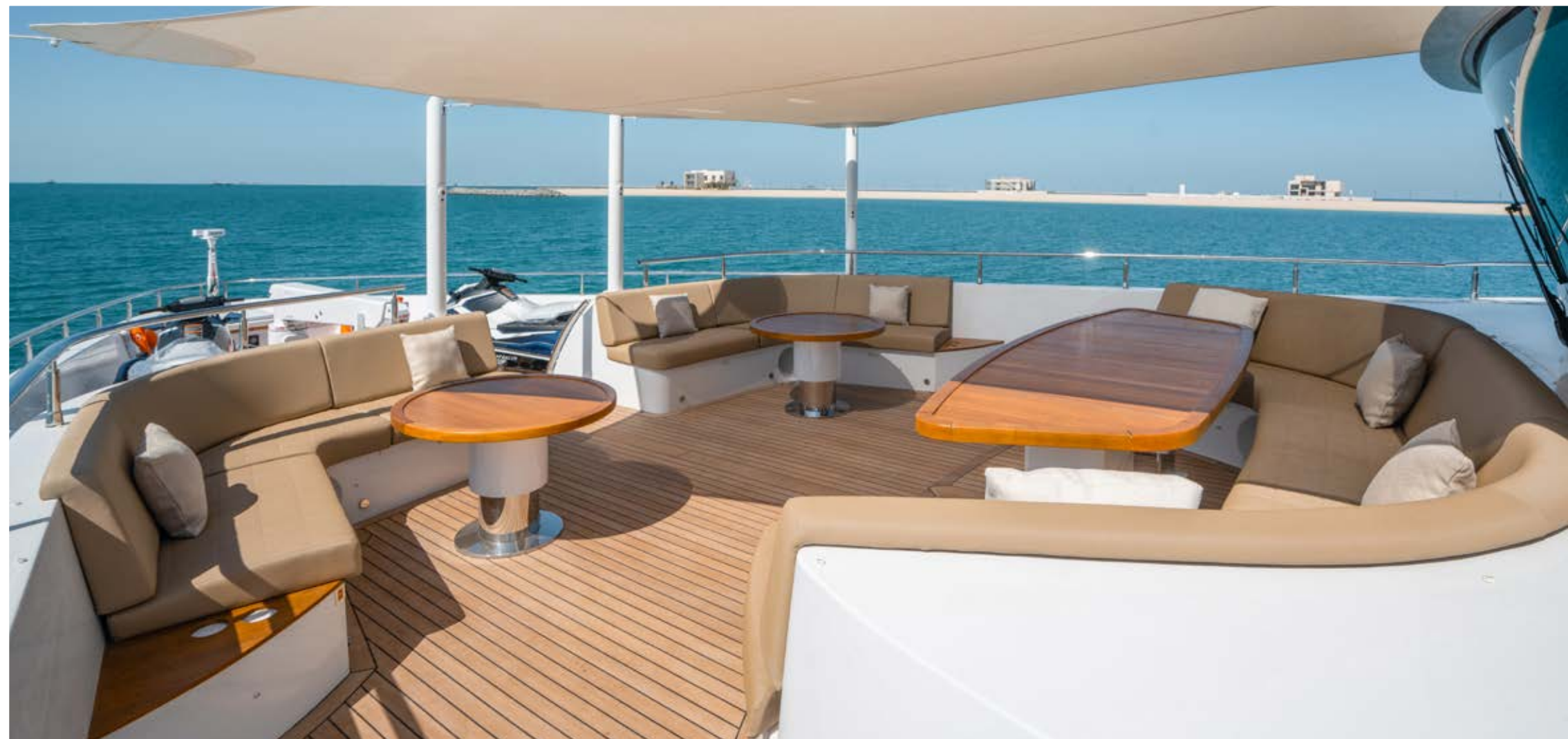
Bow Seating Area

The Majesty 140's main helm is equipped with the latest in navigation and communications technology. It features a unique window design that is a premiere for Gulf Craft with a distinctive negative inclined front glass making this superyacht stand out from its class. Furthermore, two side docking platforms on either side of the yacht assist the captain during docking.