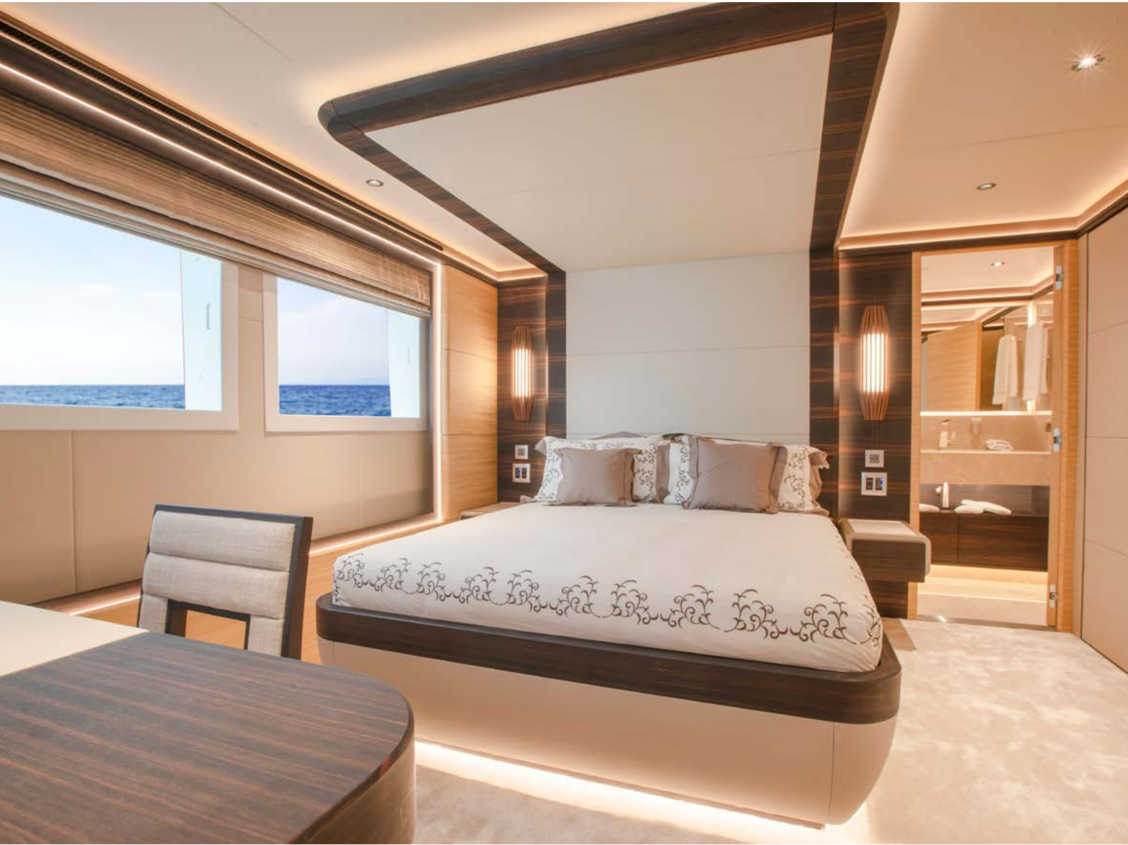
Double Guest Stateroom