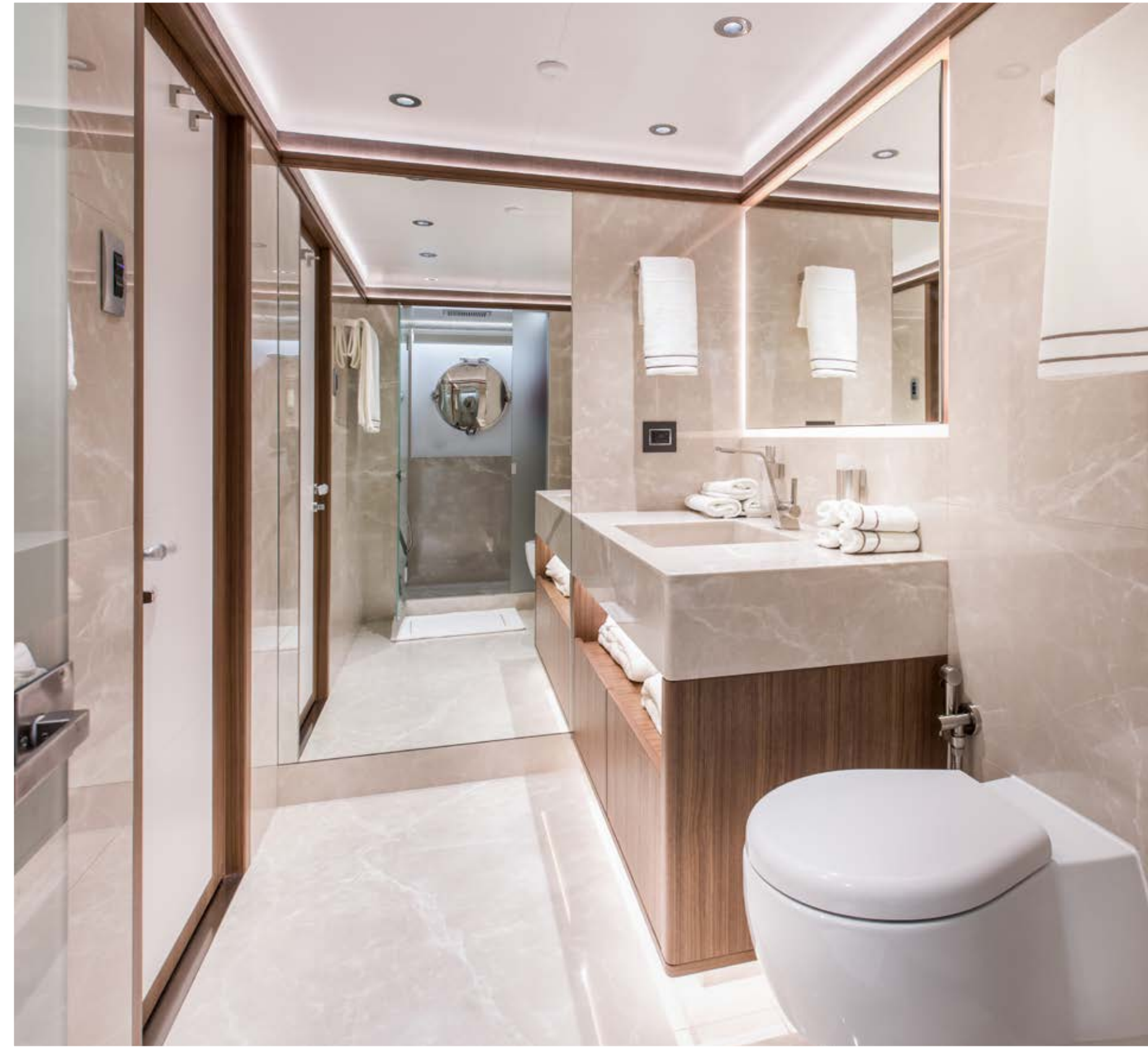
Double Guest En Suite