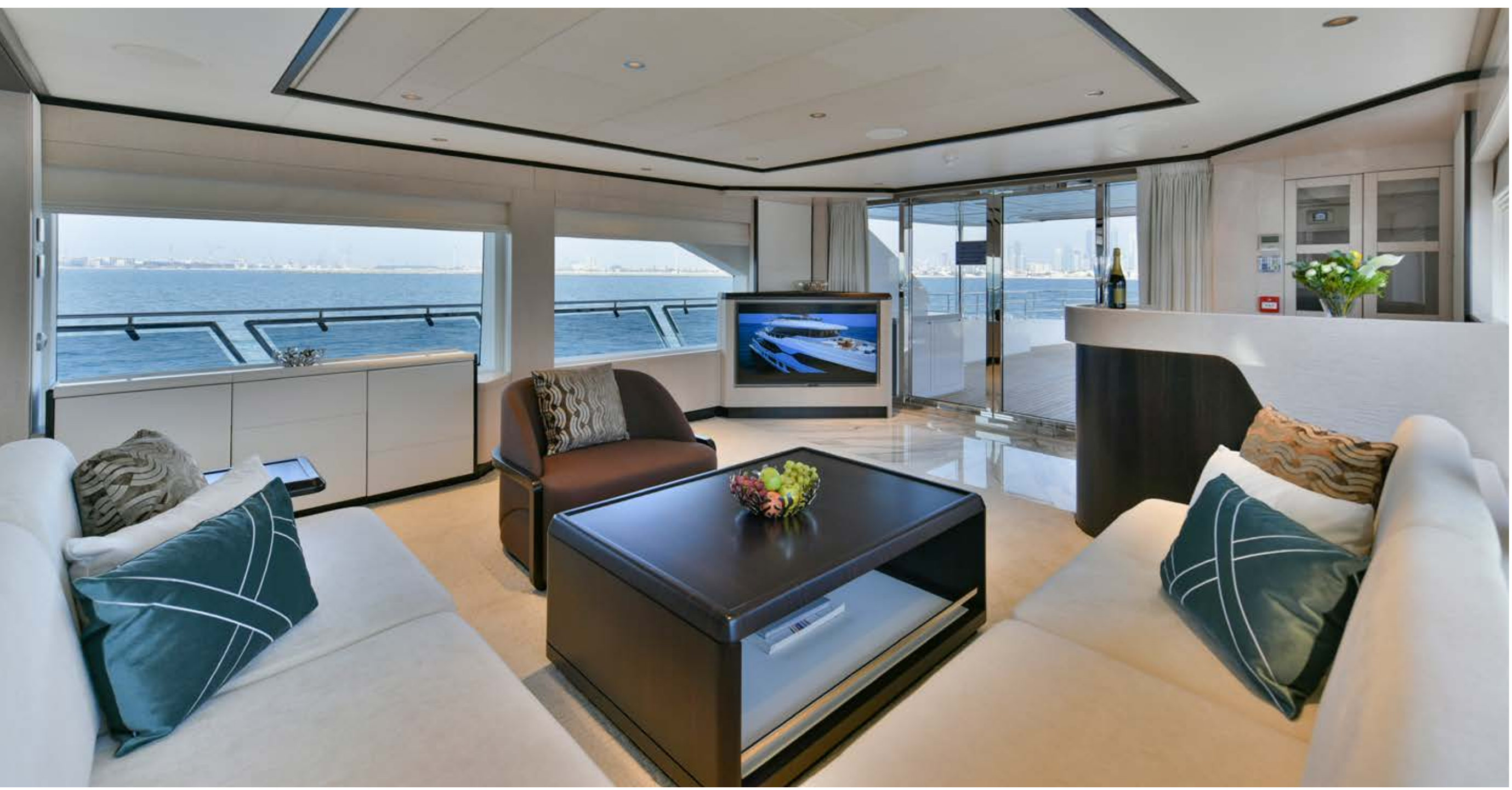
Upper Deck Saloon