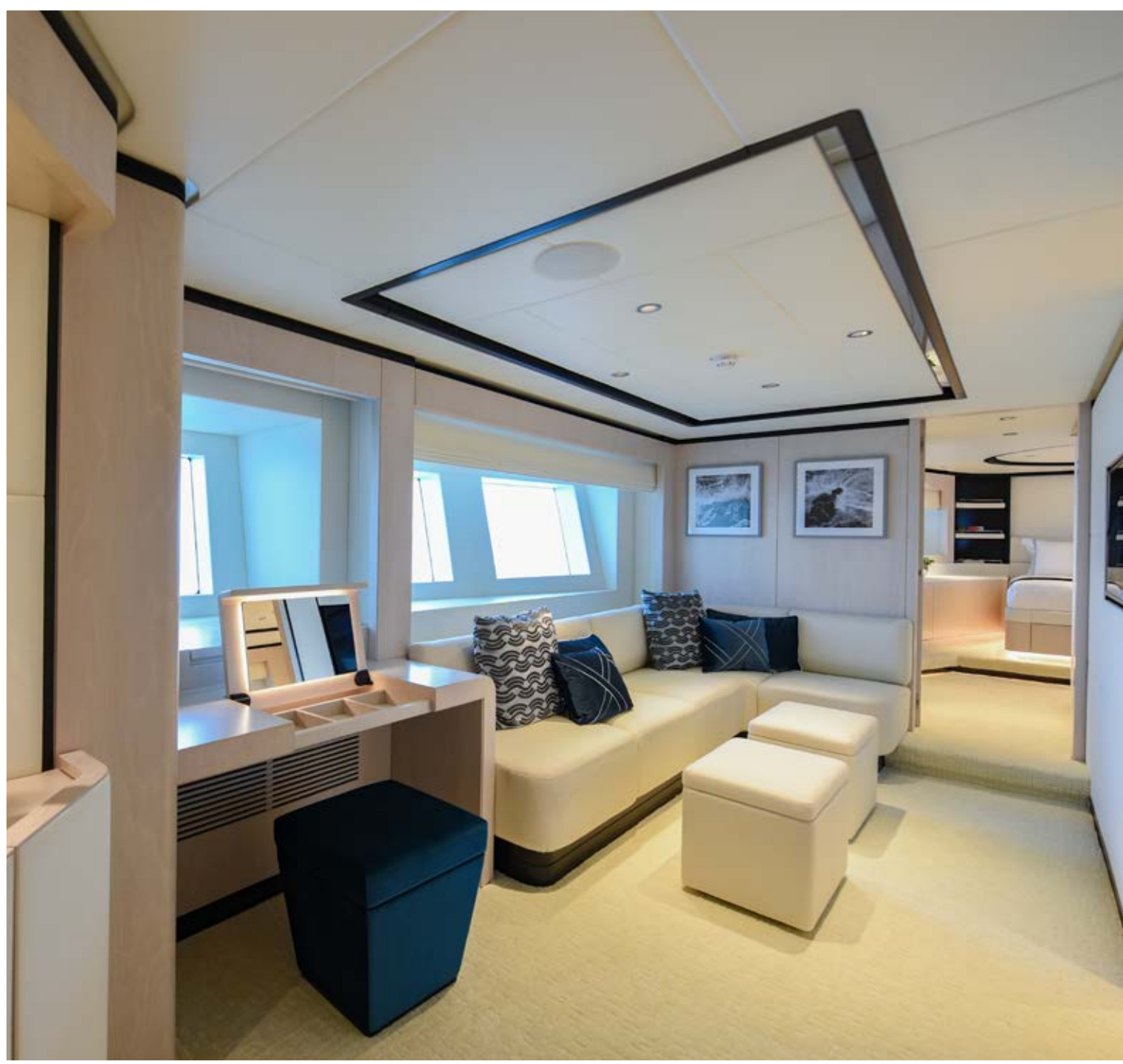
Lower Deck Lobby