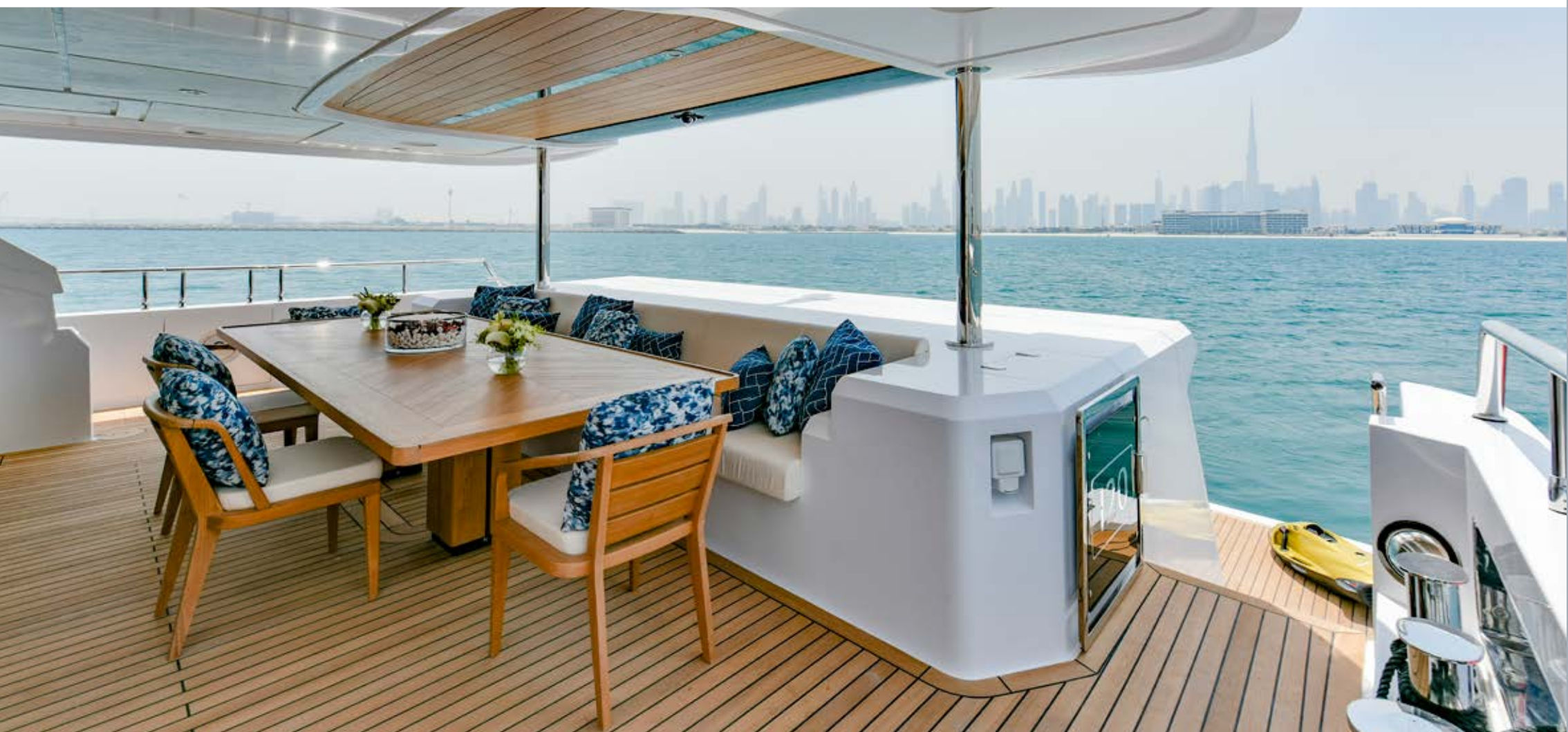
Aft Seating Area

Aggressive lines and a demanding profile define the Majesty 120, with the signature Majesty Yachts windows lining the hull. Extensive use of glass offers an unparalleled connection to the outdoors with low bulwarks allowing for an ornamental glass railing design.