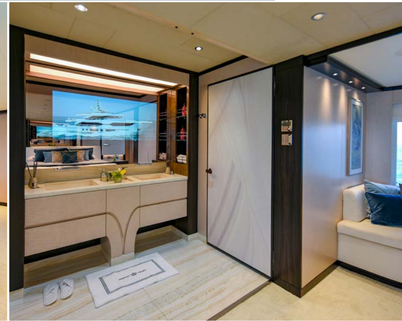
Owner's En Suite