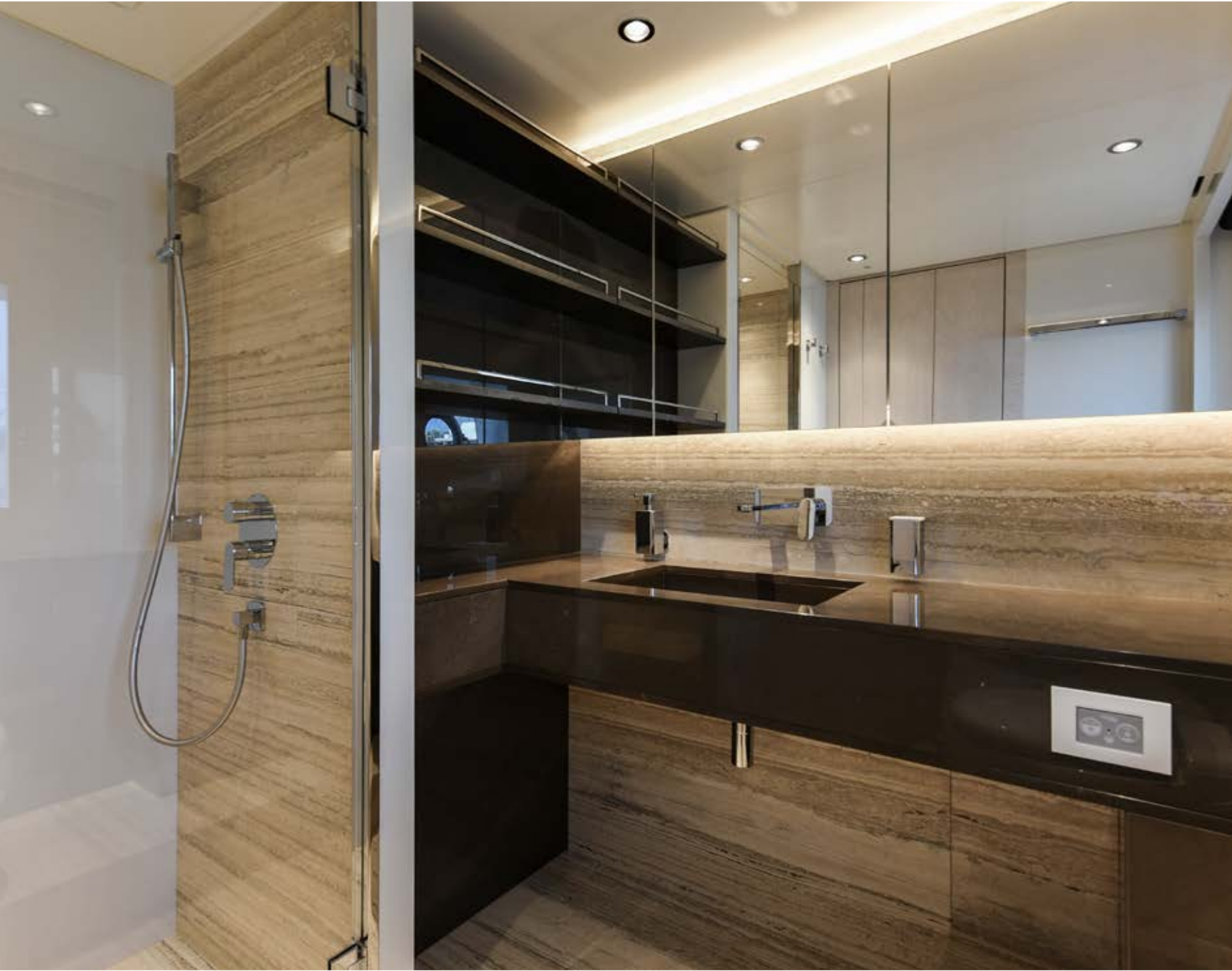
Forward VIP En Suite